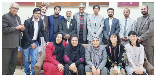
[Standing row 4th from right is Deputy Minister of Education]

One day training in New Delhi was organized on December 9, 2016 as part of Third Country Training for the Project on Improvement of Literacy Education Management in Afghanistan (LEAF2) supported by Japan International Cooperation Agency (JICA)/System Science Consultants Inc. In all 9 persons from Literacy Department of Ministry of Education, Govt. of Afghanistan including the Deputy Minister of Education (Hon'ble Sardar Mohamad Rahimi), 3 Afghan and 2 Japanese LEAF2 staff participated in the training.